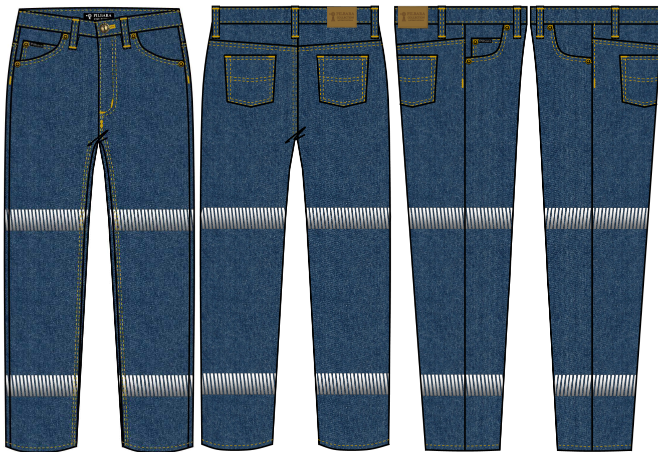
Stone Wash Denim Blue

Tape Configuration Segmented Reflective Tape, 50mm one hoop on either side leg panels knee area one hoop on either side of leg opening